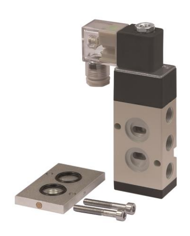
552.02 (new version)